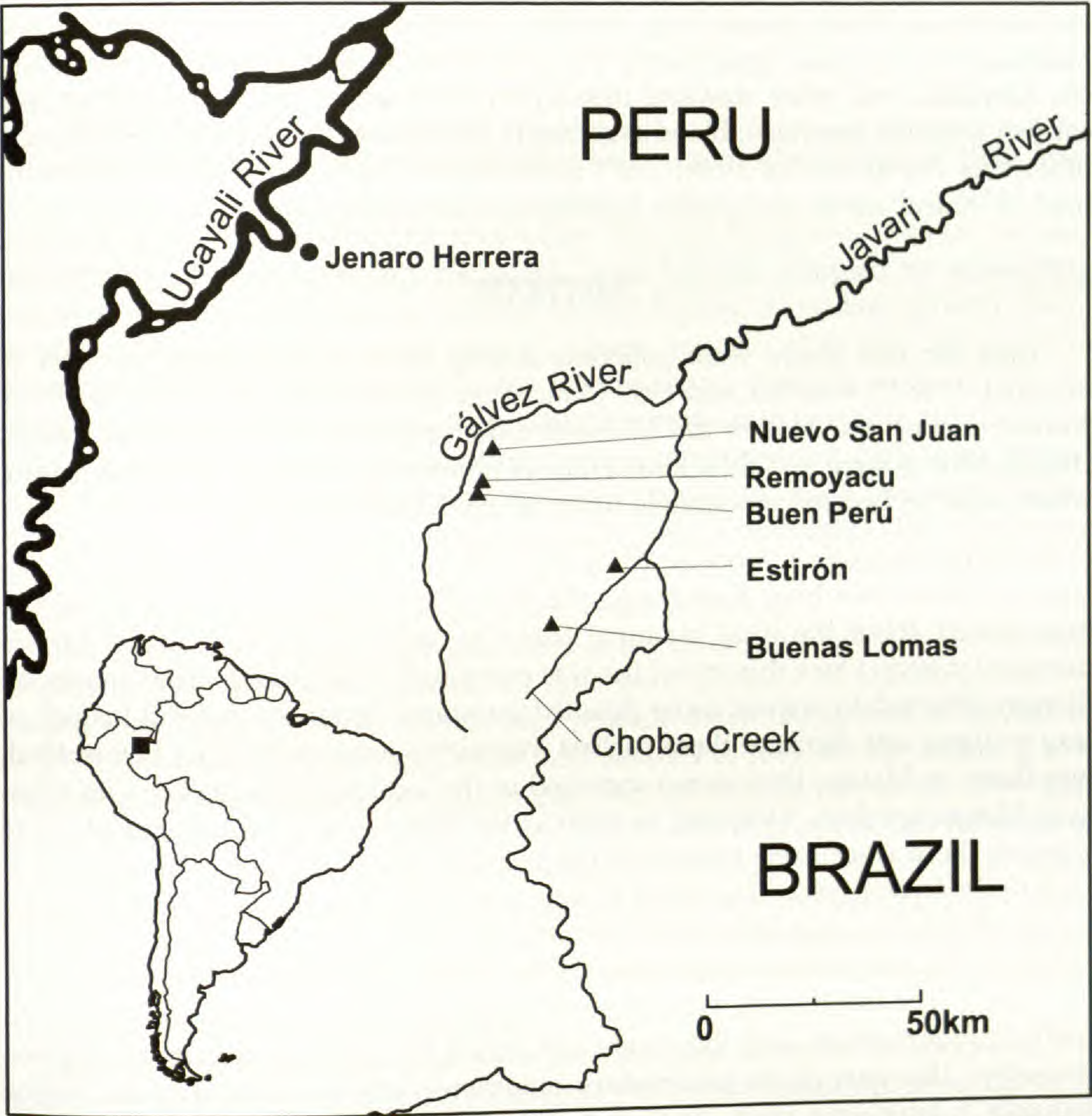
FIGURE 1.—Map showing our study site at Nuevo San Juan on the Gálvez River and other villages where Matses were interviewed or asked to record natural history accounts.

morphological differences concern the shape of prominent body parts: Sheath-tailed Bats (family Emballonuridae) are recognizable (among other traits) by their exceptionally mobile, fleshy rostrums; Free-tailed Bats (family Molossidae) by their dog-like faces and long tails that extend well beyond the flight membranes; and Long-tongued Bats (subfamily Glossophaguinae) by their elongated muzzles; and Round-eared Bats ( Tonatia spp.) by their exceptionally large, rounded ears.